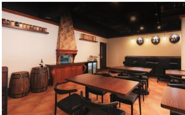
Interior of Cafe Roma