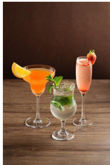
Drink – Signature Cocktails

(Left: Aperitini, Centre: Limoncello gin Collins, Right: Rossini Strawberry)