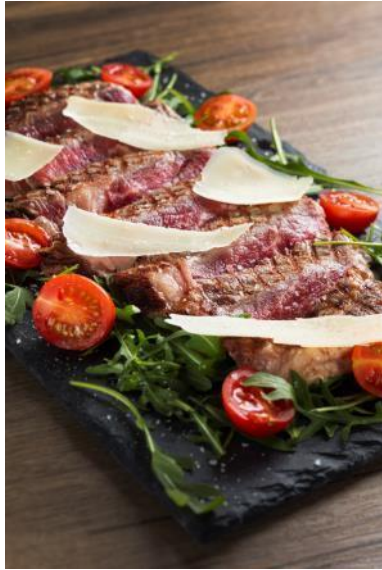
Main - Grilled US Black Angus Rib-eye Steak Tagliata