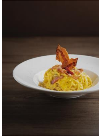
Pasta - Classic Spaghetti Carbonara