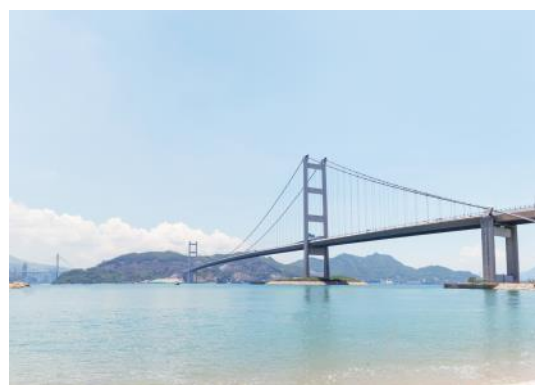
Ma Wan Seaview