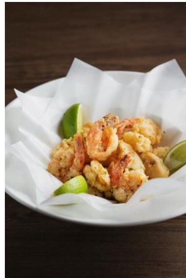
Appetiser - Fritto Misto di Mare