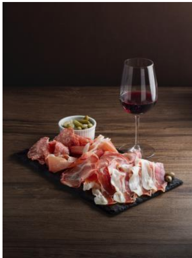
Appetiser – Assorted Cold Cut Platter

The renewed focus on authentic Italian cuisine and warm hospitality is evident in the restaurant's new design and menu. The team at Cafe Roma is excited to welcome guests to experience the newly renovated space and enjoy the authentic flavours of Italy.