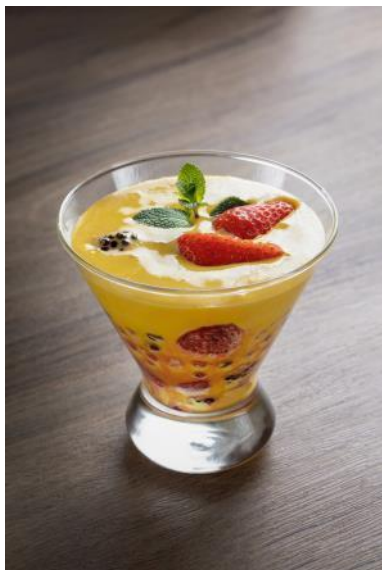
Dessert - Classic Italian Dessert Platter