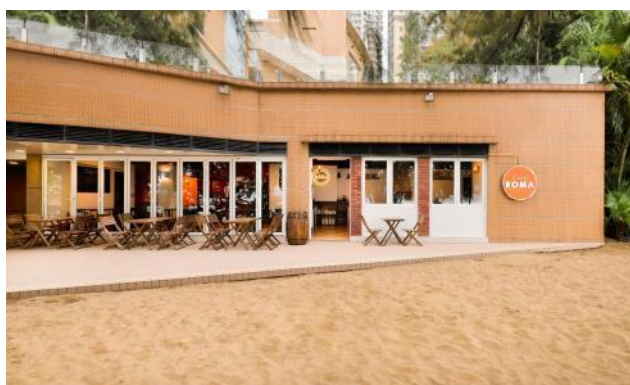
Exterior of Cafe Roma